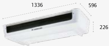
ES500 ULTRA SLIM