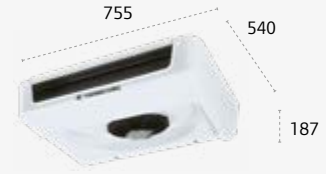
ES150 ULTRA SLIM