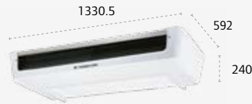
ES600 ULTRA SLIM