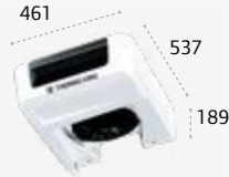
ES100N ULTRA SLIM