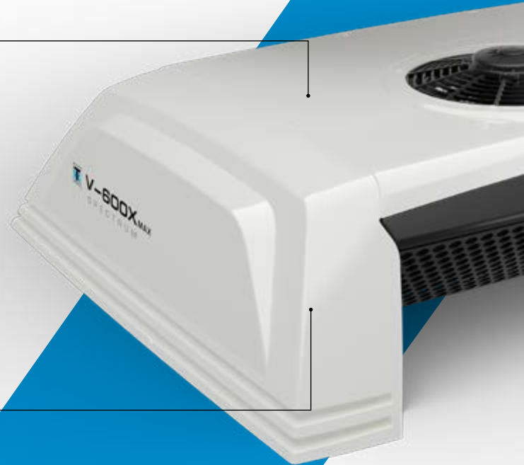
ROOF MOUNTED CONDENSER UNIT