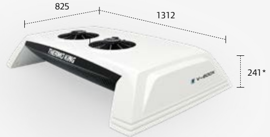
V400X/500X/600X ROOF MOUNTED UNIT

* Above heights are cover height. Heights including fans: Nose Mount - 276 mm - Roof Mount - 273 mm