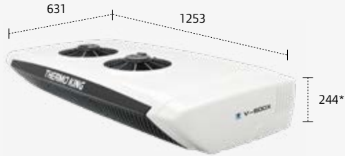
V400X/500X/600X NOSE MOUNTED UNIT