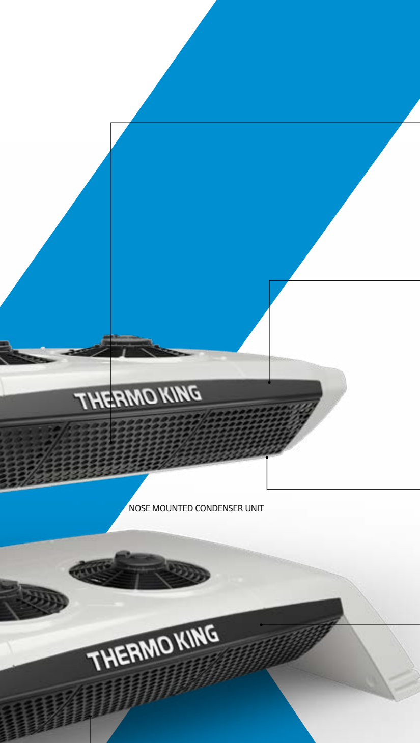
NOSE MOUNTED CONDENSER UNIT