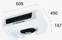
ES100 ULTRA SLIM