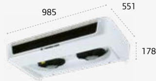
ES300 ULTRA SLIM