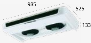
ES200 ULTRA SLIM