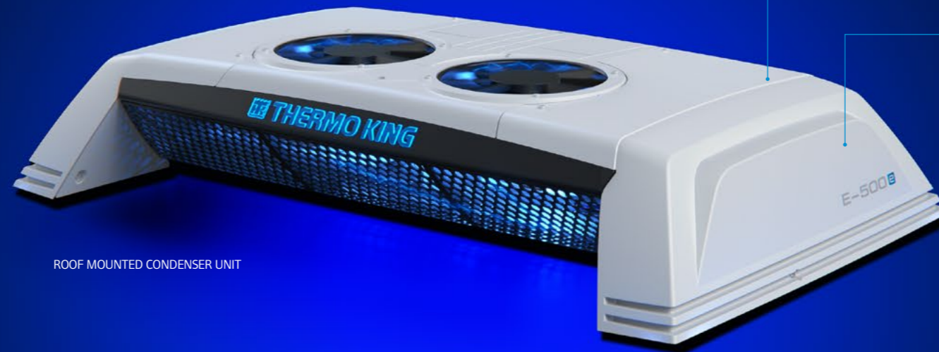
ROOF MOUNTED CONDENSER UNIT

A VERSATILE REFRIGERATION SOLUTION THAT'S THE BEV ANSWER TO INNER-CITY LIMITS.